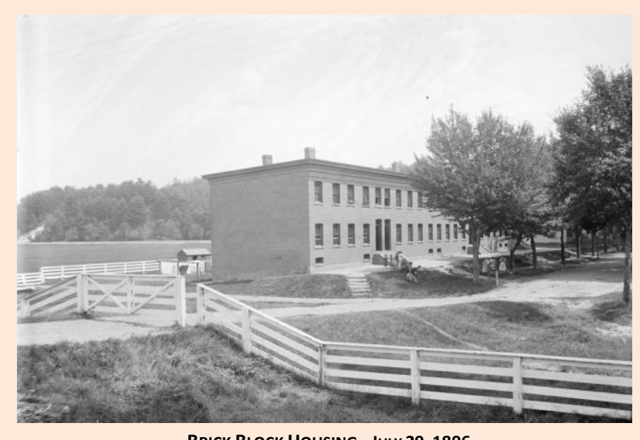
BRICK BLOCK HOUSING - JULY 29, 1896 BOYLSTON, MASSACHUSETTS

As we can see in the map above, the Central Massachusetts Railroad (part of the Boston & Maine Railroad), was situated between the factory area and the cluster of private homes with the Sacred Heart Chapel. The railroad ran from Northampton to Boston and had a stop at Sawyer's Mills known as Boylston Station (for more information about the railroad see It Began with a Mill and a Bridge, the Beginning and End of Sawyer's Mills in Friday's Fascinating Finds ). The village had its own school, store, post office, and housing for the employees of the Lancaster Mills Corporation (for more information about the school see Sawyer's Mills School in Friday's Fascinating Finds ). The housing for the employees included "one brick block of ten tenements, and nine wooden buildings with fourteen tenements, all owned by the Lancaster Mills Corporation."