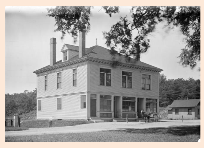
LANCASTER MILLS STORE - JULY 31, 1896 PHOTOGRAPH- DIGITAL COMMONWEALTH COLLECTION

The store that was built by the Lancaster Mills Corporation in 1862 was replaced in 1890 by the building in this photo. It housed the Boylston Post Office and a hall that was used for socials, meetings and Protestant Sunday School.<sup>5</sup>