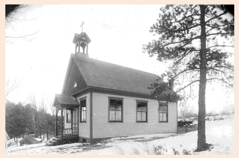
SACRED HEART CHAPEL BHSM PHOTOGRAPH COLLECTION

The Sacred Heart Chapel was a mission of St. Anthony's Roman Catholic Church in West Boylston. It was dedicated on Palm Sunday in 1890 and could seat 125 people.